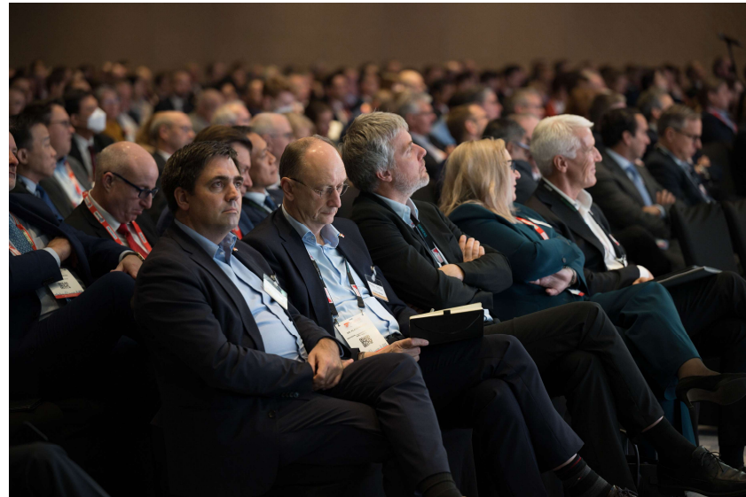
Fairmont Room, APK2022, Singapore