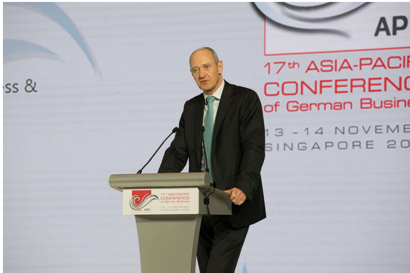
Diversification in Asia-Pacific: Roland Busch, Chairman, Asia-Pacific Committee of the German Business; CEO, Siemens