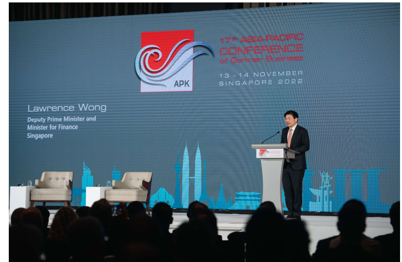
Lawrence Wong, Deputy Prime Minister and Minister Finance, Singapore